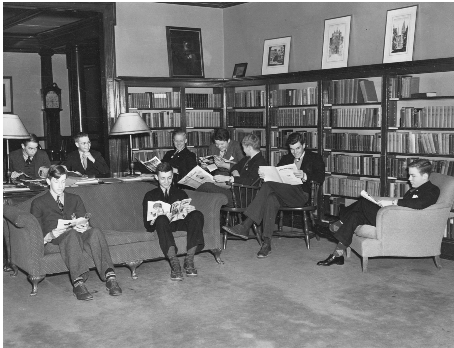
Catching up on the news of the day.