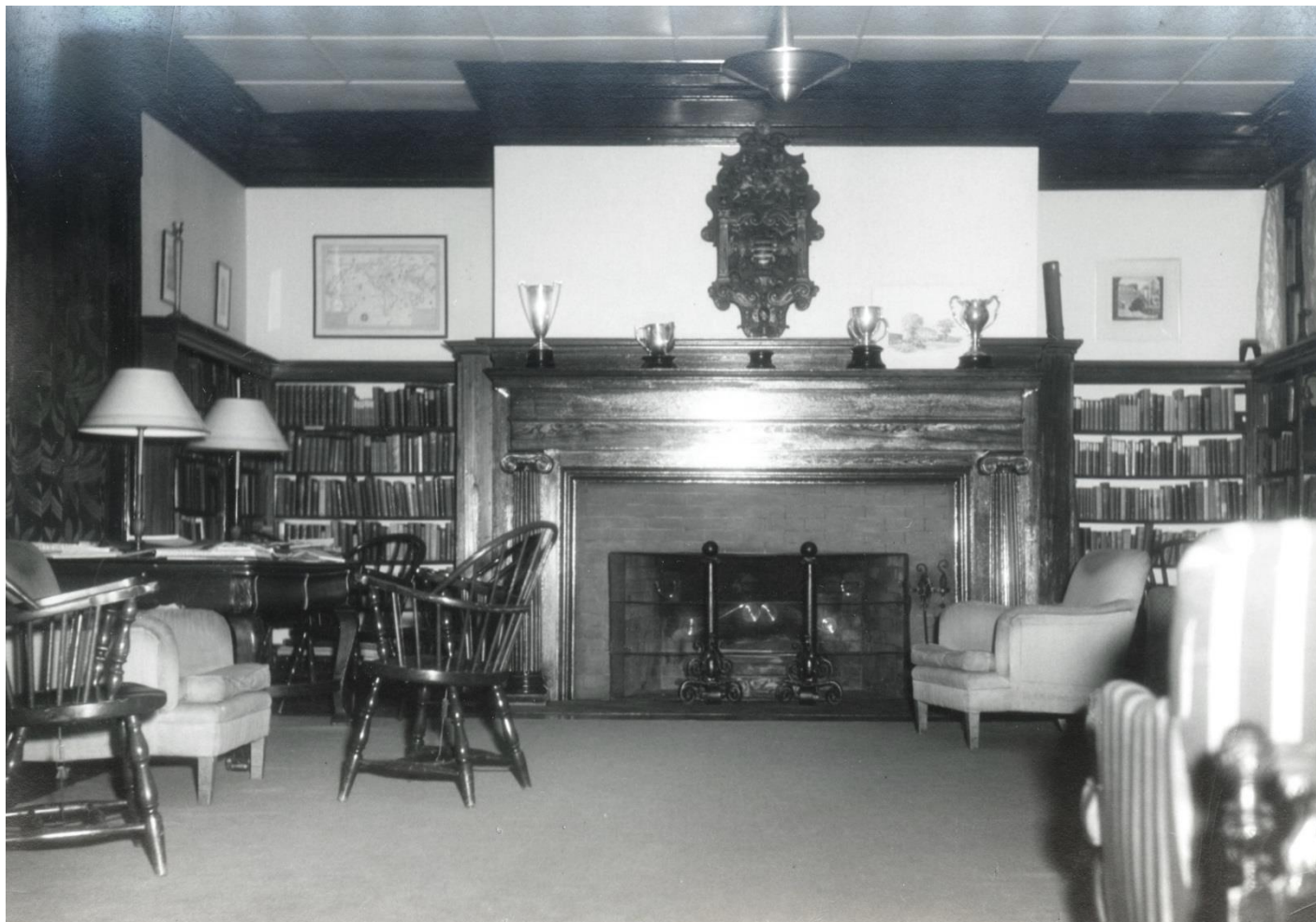
The Library c. 1940.